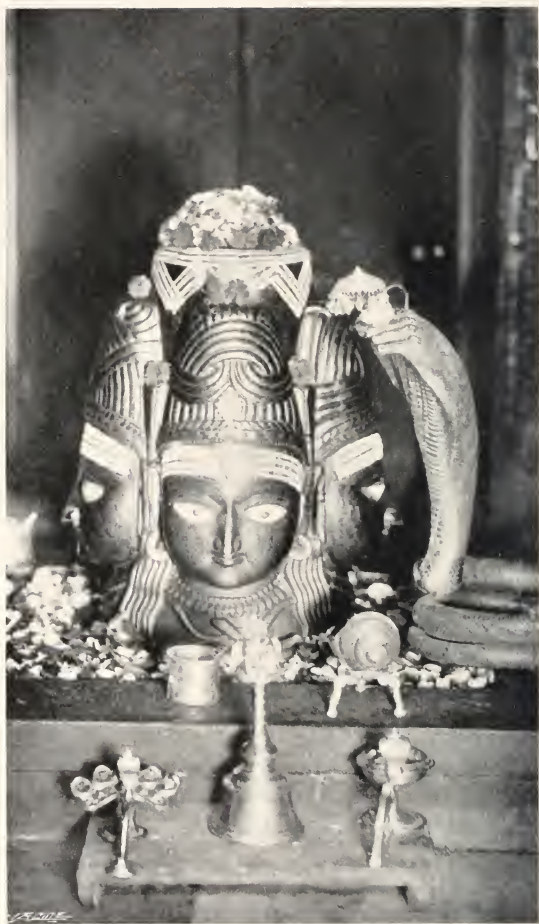
DEVI AND THE COBRA.